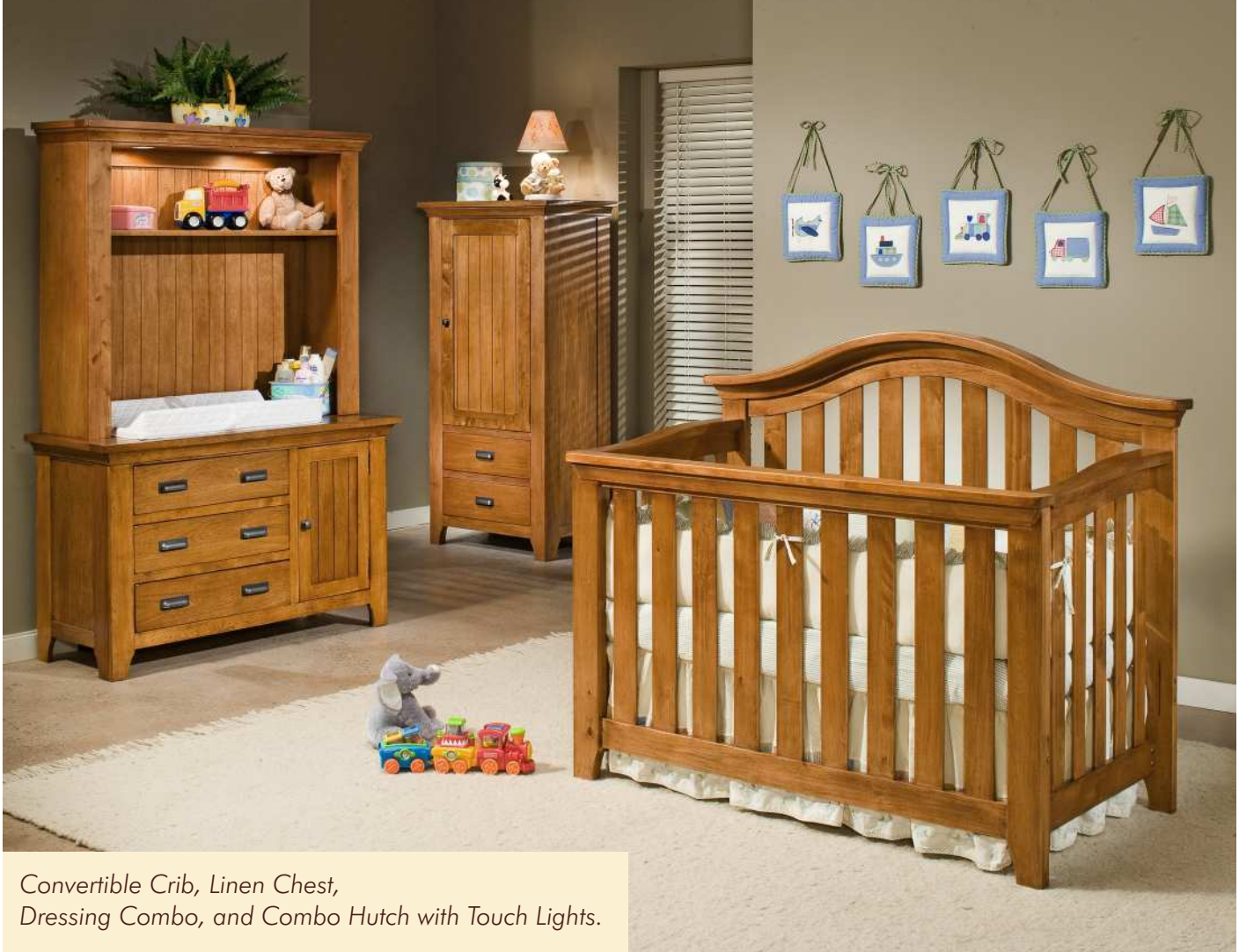
Convertible Crib, Linen Chest, Dressing Combo, and Combo Hutch with Touch Lights.

Crib converts to a full size bed with the purchase of bed rails. Shown with 5 drawer chest.